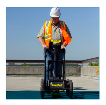
Assess the interior of concrete for deterioration