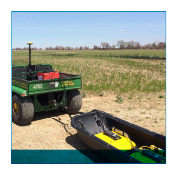
Map drainage tile

Characterize soil conditions in crop-growing areas