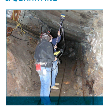
Improve mine safety practices