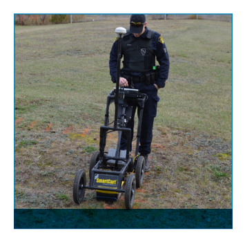
Find buried caches of drugs, money and weapons