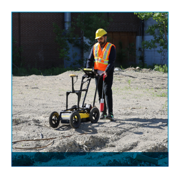
Detect metallic and non-metallic pipes and cable

Locate abandoned infrastructure and buried structures