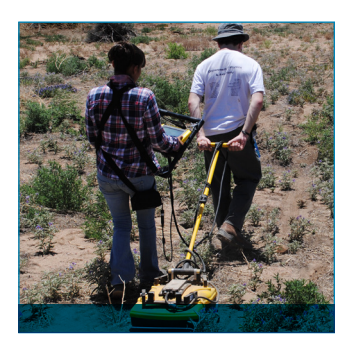
Search for artifacts and tombs

Locate foundations of ancient structures