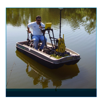
Map depth to bedrock and geological stratigraphy