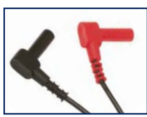
Leads: Double/reinforced 5 ft (1.5m) lead with safety 4mm banana plug