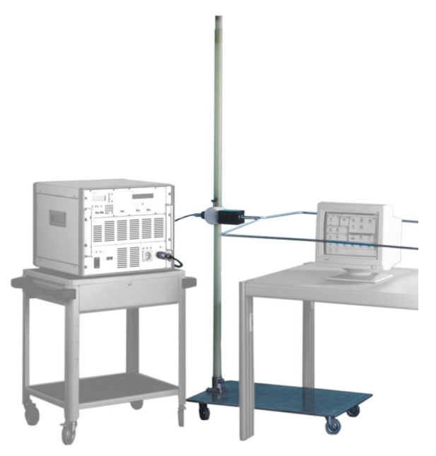
MSURGE 1mx1m antenna mounted on support stand shown with a monitor as EUT (right) and a PSURGE6 as impulse generator (left)