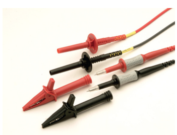
Cable insulation rating: 1 kV dc

The insulation is designed only to protect the user from the output of Megger 5 kV and 10 kV insulation resistance testers set to a maximum output voltage of 1 kV. Do not use this leadset at voltages above 1 kV.