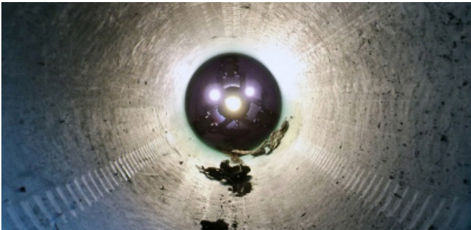
Figure 1: VT-Y200, medium class crawler designed for vertical piping, multi-bend/multi-diameter piping, cleaning, internal NDT in pipes, and marsupial operations.

Constructed out of anodized aluminum and stainless steel, designed to resist field abuse and rough operations, making it ideal for land-based applications, the VersaTrax is also fully submersible for underwater inspections. The VersaTrax family carries a base 60m (200ft) depth rating by default, thus allowing stress-free in-service inspections in conditions where water and humidity are present.