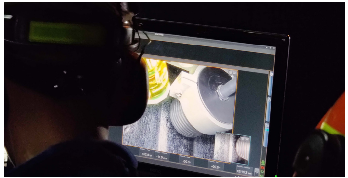
Figure 2: ICON records remote visual inspection video and snapshots, collating the information with sensor data collected from the vehicle mounted sensors with an ICON job.

Many camera options are available, ranging from full Pan, Tilt, and Zoom (PTZ) to the compact PT Spectrum camera.