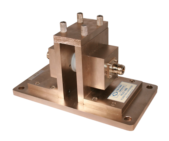
FCLCE-1000 Calibration Fixture

All values are typical values unless otherwise specified. Specifications are subject to change without notice.