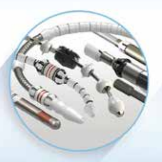
PROBES & WEDGES