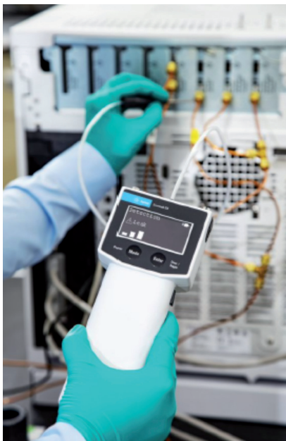
Table 1. Thermal conductivity of common gases at 0°C, 1 atm.