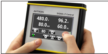
Optional SIGMA LT Hand-Held Controller.