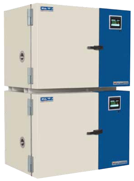
MicroClimate Benchtop Temperature Chamber shown in the stacked position.

MicroClimate chambers simulate a full range of temperature and/or humidity conditions. These chambers are designed to provide users with a compact chamber for testing small components and products for a variety of industries. Whether you need to perform temperature cycling tests or expose your product to steady state temperature environments, these chambers will maintain precise and accurate temperature/humidity control throughout your test. Choose from benchtop and reach in models to fit your laboratory testing needs.