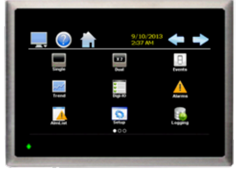
Icon - Based Navigation