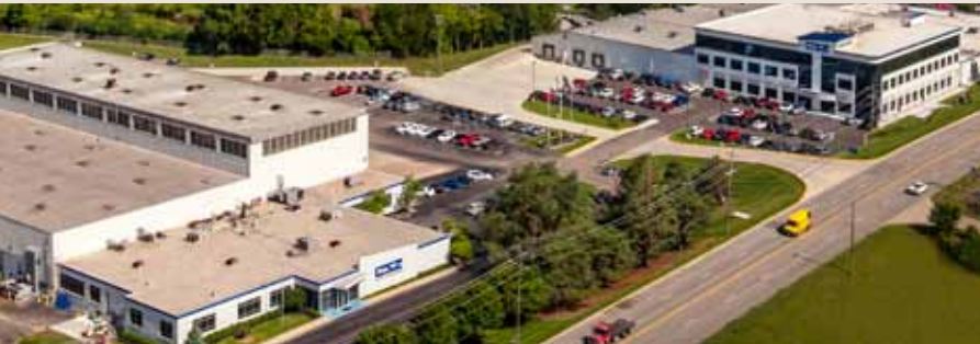
CSZ has two manufacturing facilities in Cincinnati, OH with world-wide sales and service.