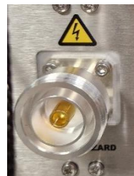
7/16 RF output

VECTAWAVE TECHNOLOGY LIMITED UNIT D THE APEX ST CROSS BUSINESS PARK MONKS BROOK NEWPORT ISLE OF WIGHT PO30 5XW UNITED KINGDOM