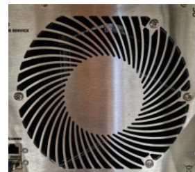
Smooth air exhausts