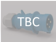
Option a) 200-240Vac, 4 pin plug (No neutral)