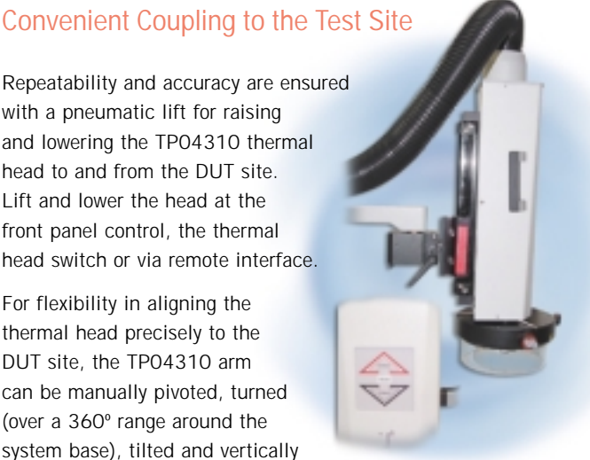
Switch for raising or lowering the ThermoStream head to the test site with pneumatics

For flexibility in aligning the thermal head precisely to the DUT site, the TP04310 arm can be manually pivoted, turned (over a 360° range around the system base), tilted and vertically swung. Four mechanical locks on the arm hold the thermal head precisely as positioned.