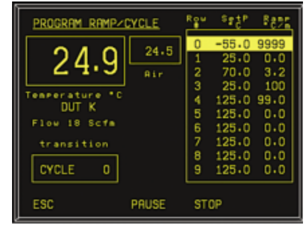
Set up to 12 temperature tests sets in Program Mode, while DUT Control monitors device temperature directly.