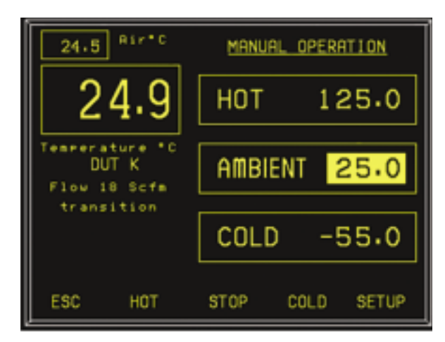
Real time DUT and air temperatures are displayed in Manual Mode operation with DUT Temperature Control.