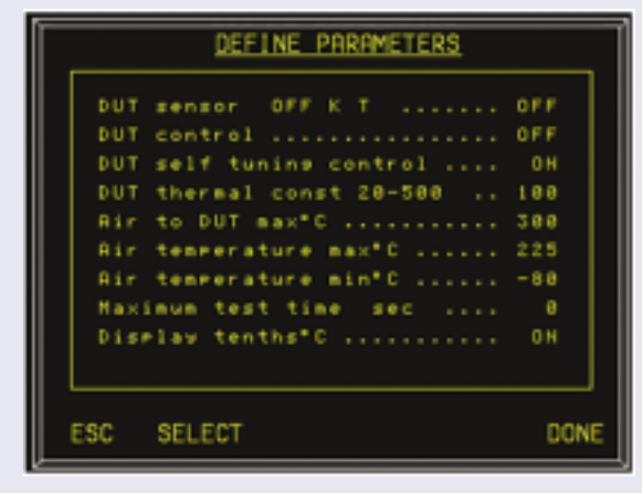
Select DUT Temperature Control, Self-Tuning and additional features as desired.