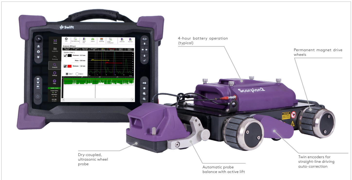
Figure 1: Annotated breakdown of Scorpion2.

An optional harness is also available to support the use of the system for longer periods of time. The adjustable rear stand, the top handle, and the four corner anchor points all make Swift incredibly practical for on-site inspections.