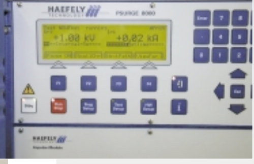
PREPARED TO MEET THE FUTURE