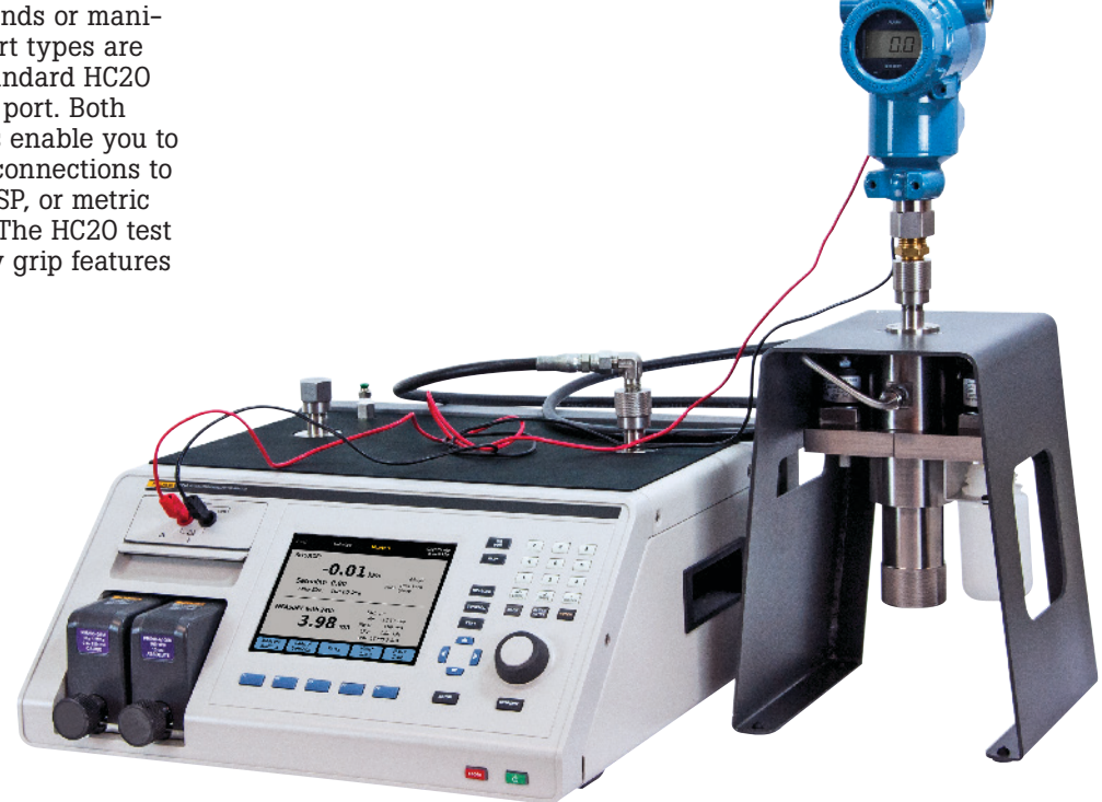
The Contamination Prevention System helps keep the values on the 2271A clean and free from debris.

The CPS provides an unprecedented level of protection by maintaining uni-directional flow away from the controller, a gravity sump system, and a twostage filtering system.