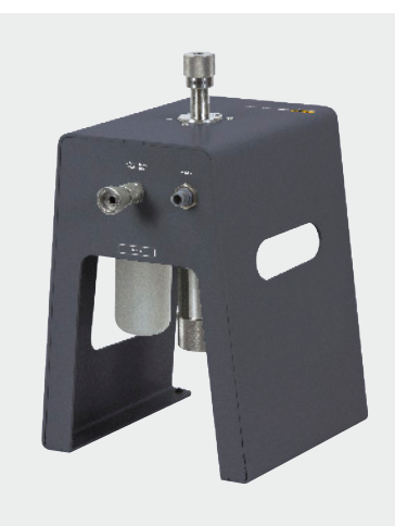
The Contamination Prevention System acts as a test stand for connecting units under test, as well as for preventing contamination from reaching the 2271A.

Visit www.flukecal.com for more information about Fluke Calibration products and services.